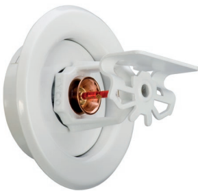
Tyco® Extended Coverage Horizontal Sidewall Sprinkler Ensures maximum reach & protection